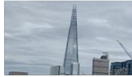
THE SHARD* IN LONDON