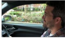
DADDY DRIVING TO ISLE OF WIGHT