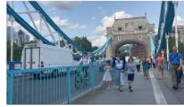
TOWER BRIDGE: A BRIDGE WITH TWO TOWERS ON IT